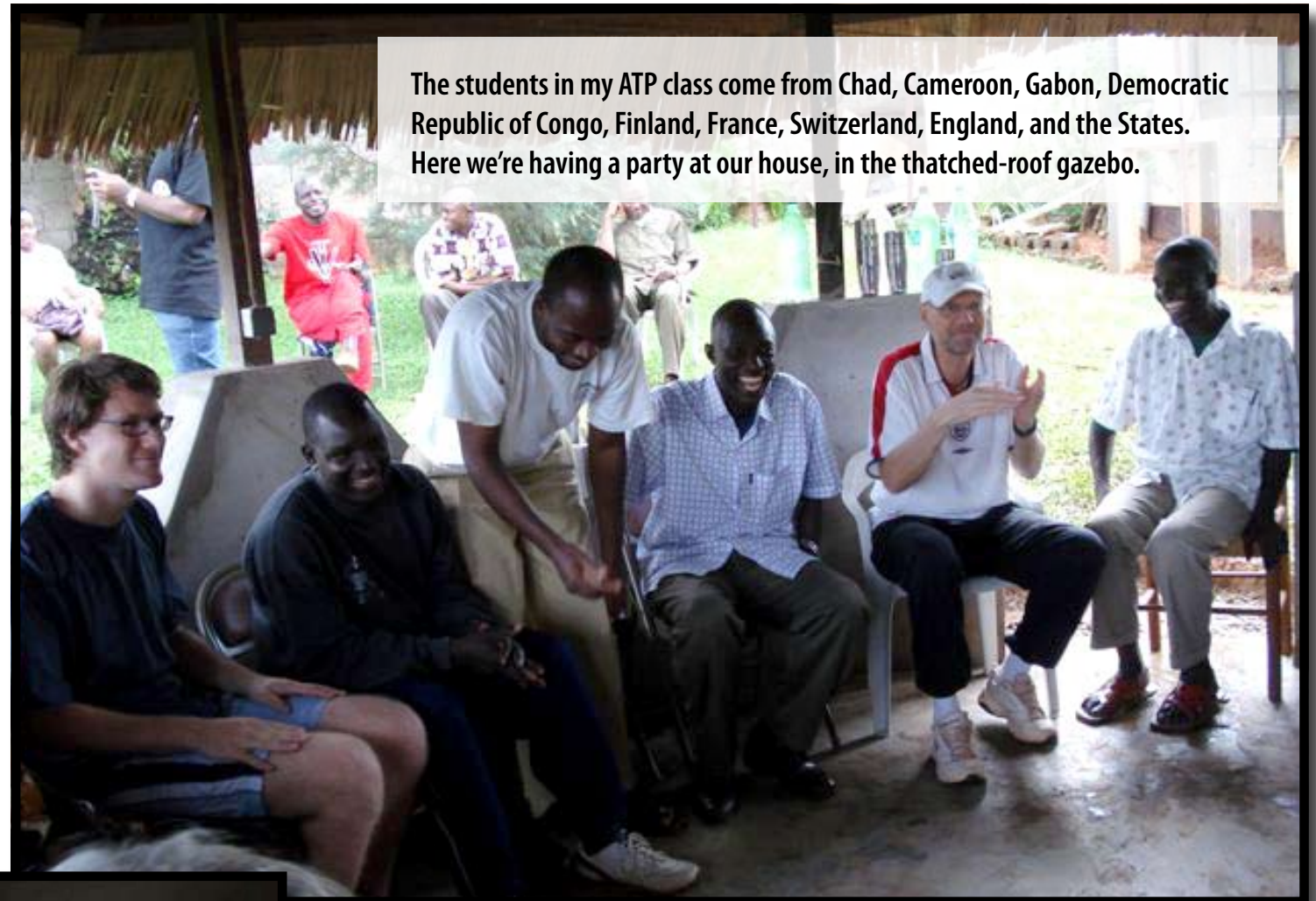
The students in my ATP class come from Chad, Cameroon, Gabon, Democratic Republic of Congo, Finland, France, Switzerland, England, and the States. Here we're having a party at our house, in the thatched-roof gazebo.